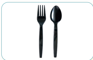
Plastic forks and spoons